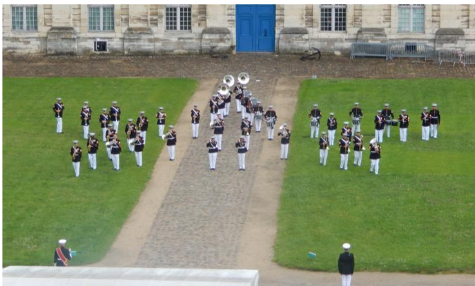
The 2d Marine Division Band during the Military Tattoo at the Chateau de Vincennes in Paris, France.

In May, the 2d Marine Division Band had the privilege of traveling to Europe to perform in a few monumental ceremonies. The Band started their tour in Paris, France where they performed at the Battle of Belleau Wood Memorial Ceremony along with a parade that ended at the famous "Devil Dog Fountain." They also performed a concert at Les Invalides and a military tattoo at the Chateau de Vincennes. The Band then traveled to England to perform in the Beating Retreat Ceremony and Horse Guards Parade to celebrate 350 years of the Royal Marines. The Marines in the 2d Marine Division Band were excited to have had this opportunity and hope to go back soon.