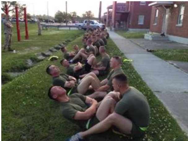
Pictured above: The 2d Marine Division Band during the crunches portion of the PFT.

The 2d Marine Division Band took their annual Physical Fitness Test (PFT) in May and did remarkably well! The PFT consists of 3 events: first is pull ups (males) or flexed armed hang (females). Second is crunches, and the goal is to do as many as possible in 2 minutes. Finally, is a timed 3 mile run. The band average was 240 out of 300 (first class).